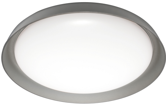
Plate | Decorative ceiling luminaires with WiFi technology